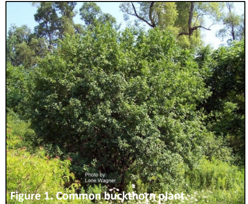
Figure 1. Common buckthorn plant.

Management: In Montana common buckthorn is not a noxious weed, and the invasive potential of this plant is unknown. Since 1921 it has been reported in 27 Montana counties. In states where common buckthorn is noxious, management is typically achieved using a combination of mechanical and chemical control. Seedlings (stems 0.5 to 1.5" diameter) can be removed by hand-pulling or digging, or a foliar herbicide application (glyphosate, triclopyr, triclopyr + 2,4-D) can be used for dense patches. Bigger plants (up to 6" diameter stems) can be treated using a basal bark herbicide application in the fall. Large plants (>6" diameter stems) should be treated using a cut-stump + herbicide treatment in fall or winter (common buckthorn is a re-sprouter).