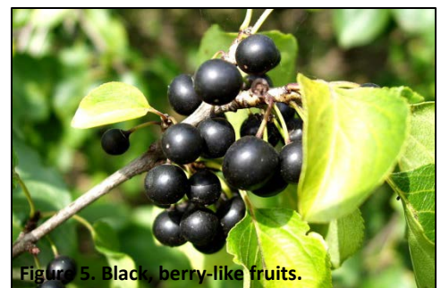
Figure 5. Black, berry-like fruits.