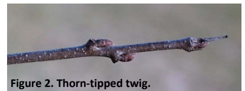
Figure 2. Thorn-tipped twig.