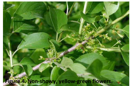
Figure 4. Non-showy, yellow-green flowers.