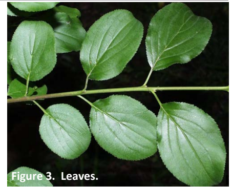
Figure 3. Leaves.