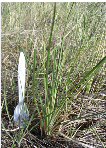
FIGURE 1. Western salsify rosette.

Western salsify has linear, grass-like leaves that clasp the stem at the base. Prior to bolting and flowering, the leaves can be readily mistaken for grass (Figure 1). However, they have a smoother and more rubbery-like feel than grass leaves, have hairs in the axils, and exude a milky juice when broken. The yellow, dandelion-like flower heads are born singly on 12 to 40 inch (30 to 100 cm) stems that are swollen and hollow below the flower head (Figure 2). Ten or more long, narrow involucral bracts extend beyond the flowers. There are 20 to 120 ligulate flowers per head. The flowerhead matures to form a three to four inch diameter fluffy sphere comprised of seeds with long, slender beaks and a white, umbrella-like pappus that aids wind dispersal (Figure 3). The fluffy sphere of seeds looks similar to that of a dandelion, only much larger. Western salsify has a thick, fleshy taproot.