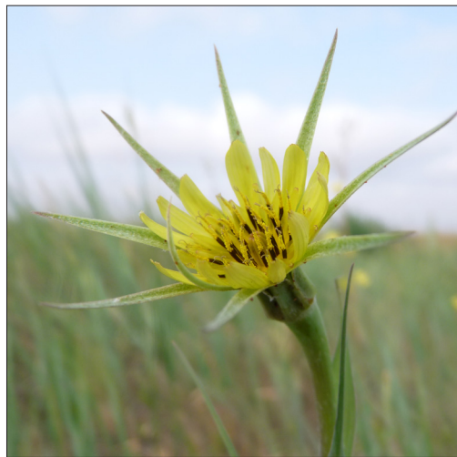
FIGURE 2. Western salsify flower.