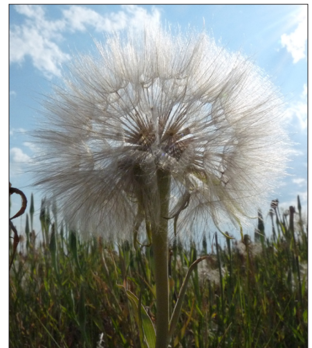
FIGURE 3. Fluffy sphere of western salsify seeds.