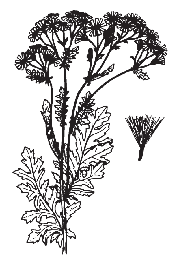
FIGURE 3. Tansy ragwort. Tansy ragwort has 'petals', termed ray flowers, in contrast to common tansy.

Common tansy spreads mainly by seeds and from creeping rhizomes, to form dense clumps of stems. The roots are shallow but densely occupy the upper two feet of soil, meaning they're highly competitive with other plants for soil nutrients and water. Each stem grows a cluster of numerous disc flowers during midsummer. These persist throughout the summer and into early fall. Pollination occurs through a variety of insects – flies, butterflies, moths and honeybees.